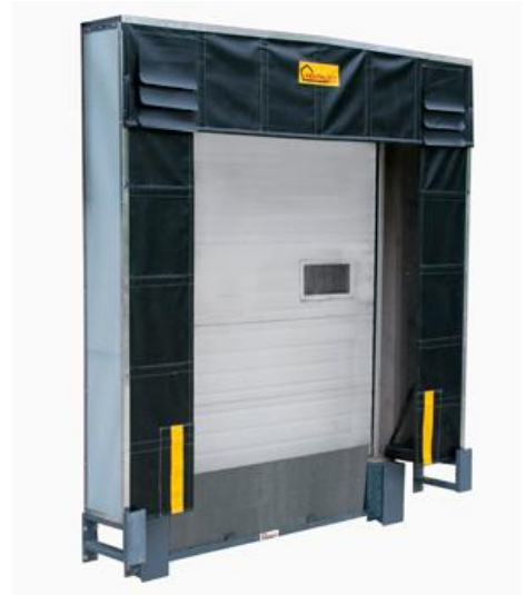
PS-400 Dock Shelter