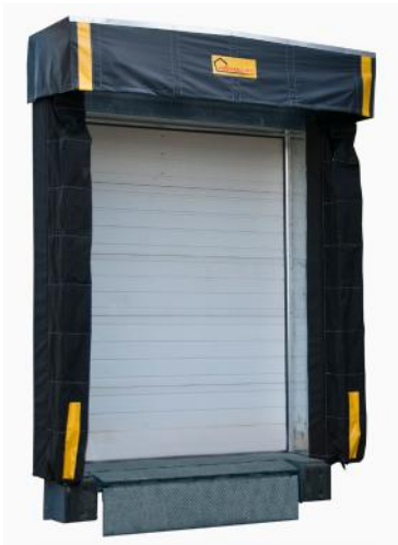
PSI-350 Inflatable Dock Seal