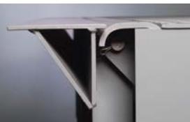
Constant radius rear hinge