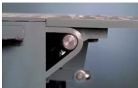
Two-point crown control