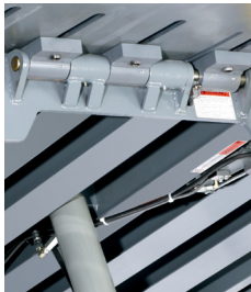
Two-point crown control