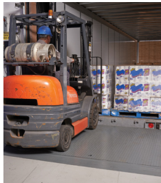
Full-width trailer access for unobstructed end loads