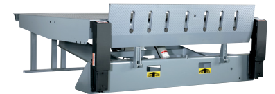
Rugged steel Safe-T-Lip barrier helps prevent drop-off accidents.

Mechanically operated to minimize maintenance and interference with loading/unloading.