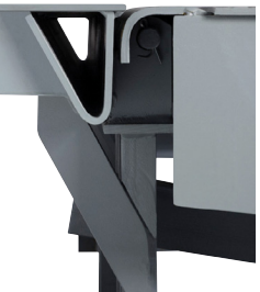
Constant radius rear hinge