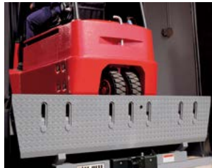
Rugged steel Safe-T-Lip® barrier helps address drop-off accidents.

The totally enclosed motor is rated at 110V, 60Hz, single phase. All operator controls are mounted in a gasketed, NEMA 12 enclosure. All electrical components, connections and wiring are UL listed or recognized. Please Note: Unless specifically noted on quotation, all electrical including hook-up is the responsibility of others.