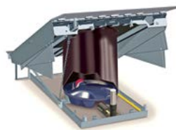
Air tower protects blower motor from dirt and debris, especially in wash-down conditions.