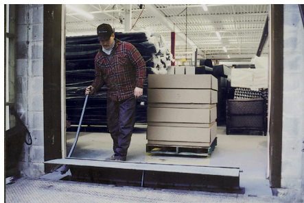
The edge of dock lip automatically locks as the deck is extended.