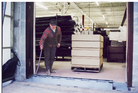
Torsion spring assist and integrated handle result in low effort activation.