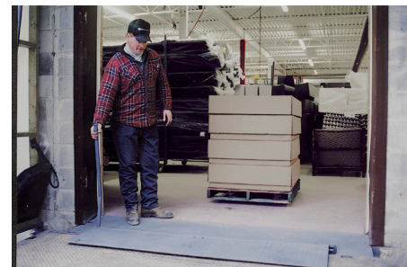
Safety is enhanced through less operational effort. Increased convenience and safer than aluminum dock plates.