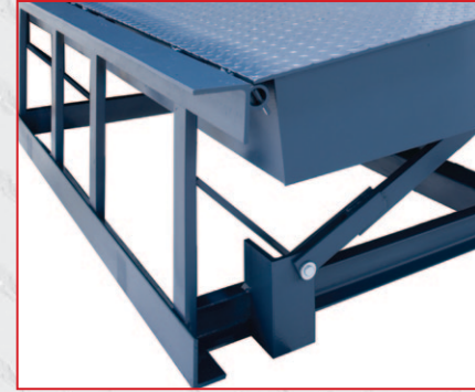
Fixed Rear Hinge With Solid Steel Supports and Full Width Rod

The front and rear hinge rods are constructed of SAE 1045 superior shaft and are factory coated with anti-seize lubricant.