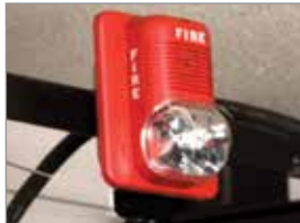
Horns and Strobes