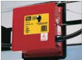
WayneGuard™ Fire Door Release Device