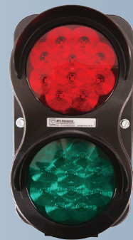
Universal Red and Green LED Lights