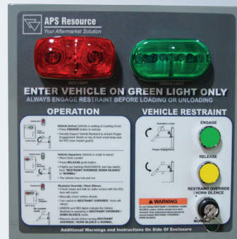
Compact 12"x12" Size Heavy Duty Industrial Control Box