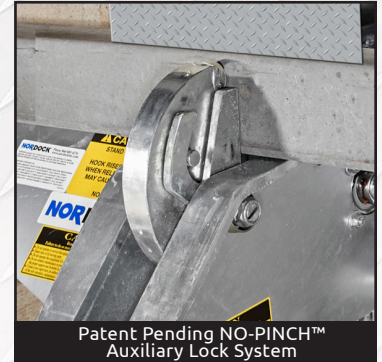
Patent Pending NO-PINCH™ Auxiliary Lock System

The enclosed housing design is a structural welded assembly constructed with 5/16" side plates and 1/2" high tensile reinforcement on leading edge to withstand repeated impacts from backing trailers.